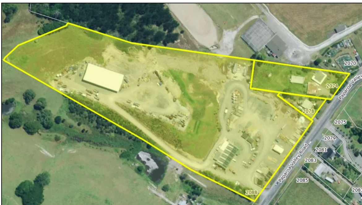
Figure 2: Aerial view of the site including adjoining neighbouring sites at 2074 and 2078 Paparoa Valley Road.